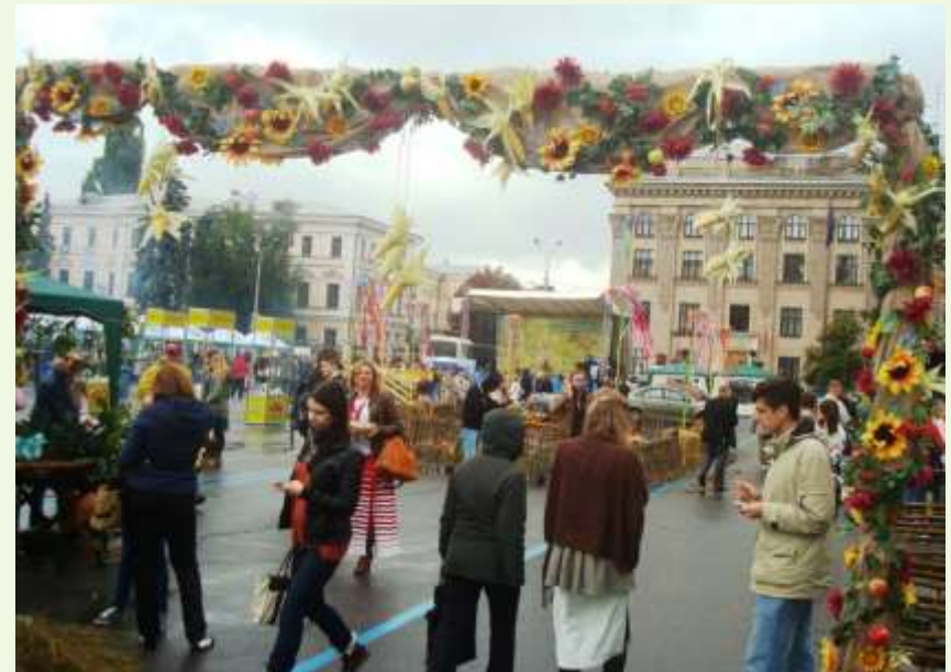
Organic Federation of Ukraine